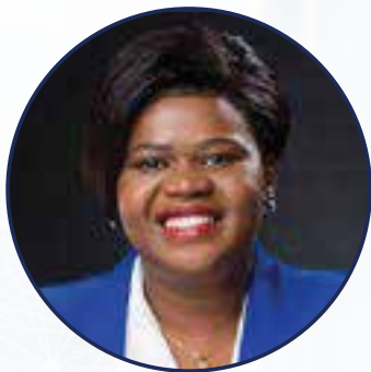
H.E Gladys Wanga Governor, Homabay County