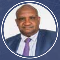
FCPA Githii Mburu, MGH Former Commissioner General, Kenya Revenue Authority (KRA), Kenya