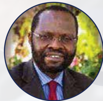
H.E Prof Anyang' Nyong'o Governor, Kisumu County